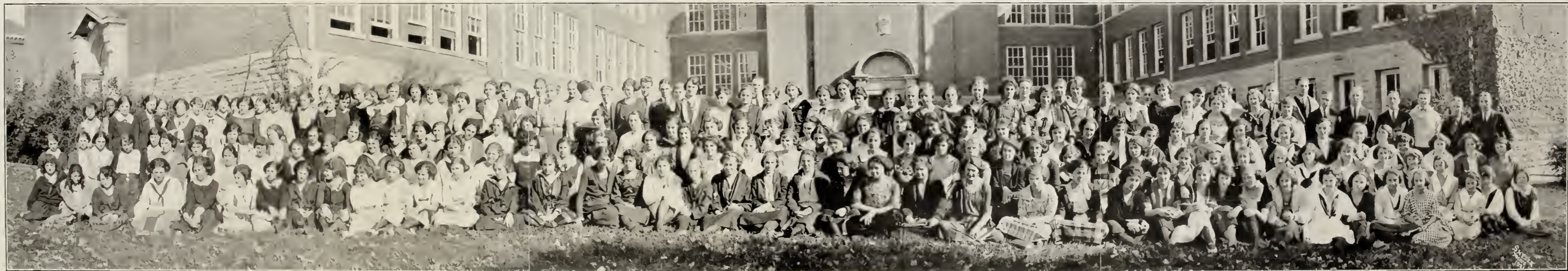
FRESHMAN CLASS, TEACHERS COLLEGE